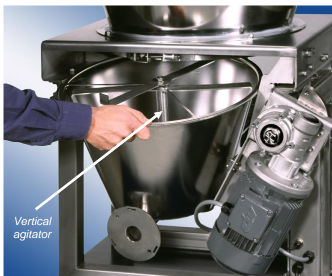
Figure 3 Internally agitated screw feeder