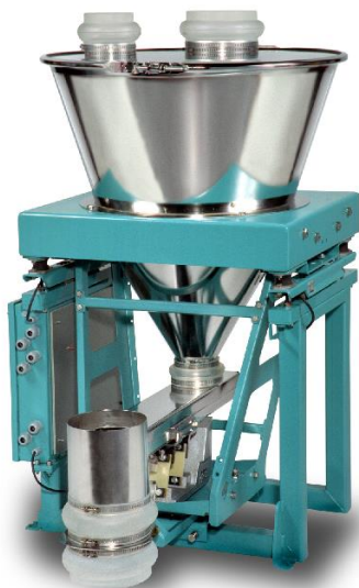
Figure 1 Vibratory feeder with discharge tube

The volumetric feeders described here can also be controlled gravimetrically so they feed material at the desired rate by weight rather than volume. Gravimetric feeder control is well-suited for a material with a variable bulk density or an application requiring very high feeding accuracy. [Editor's note: Contact the author for detailed information on selecting volumetric or gravimetric feeder control for your application.]